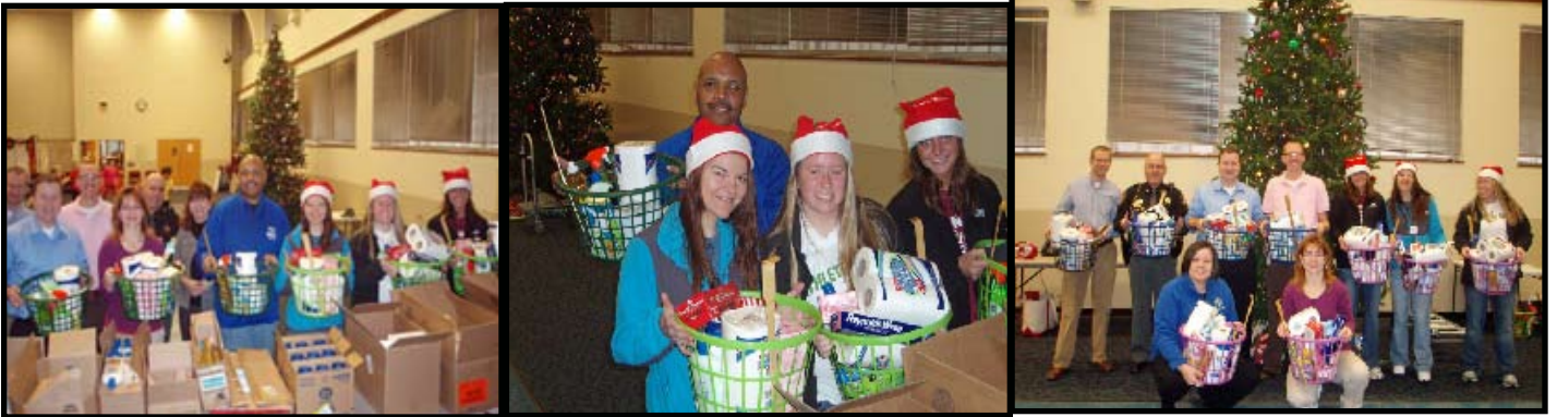
Preparing Community Outreach Holiday Baskets for Seniors